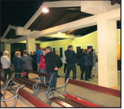
Confessionals in Medjugorje

The autumn leaves change from green into beautiful, beautiful colors as they are transformed, and so it is with us! Change can be hard and difficult, but it can bring about great peace and beauty! God gives the Grace to all those who ask from their hearts! Remember what our dear Blessed Mother keeps telling us over and over: My dear children, "Pray from your Hearts", not rattling off a prayer like we were auctioneers, fast and without any thought behind them. She asks us to: "PRAY FROM OUR HEARTS"! Holy Confession is just that – Jesus gives us this Sacrament, and it is powerful and holy, that is why Our Lord has given us the priests and the Holy Church.