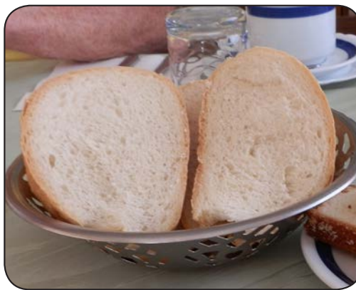
Bread and water in Medjugorje

If we are incapable of fasting, we can pray in other ways,