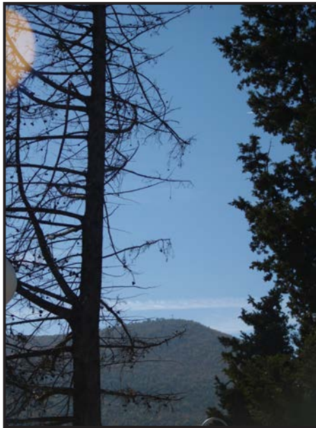
Fall in Medjugorje

What this is saying is GOD created life, ALL LIFE! Jesus made it clear to LOVE one another, but for humans to change a man into a so-called woman or vice versa is to distort God's plan, to make ourselves God. To turn the other cheek and say: "That is not my problem; I don't want to get involved," is in direct opposition to St. John, as he tells us, "Little Children, let us love in DEED and in TRUTH and not merely talk about it!" To love is to keep God's commandments! If God created them, male and female, then they are male and female! God does NOT make mistakes! We are what God created us to be.