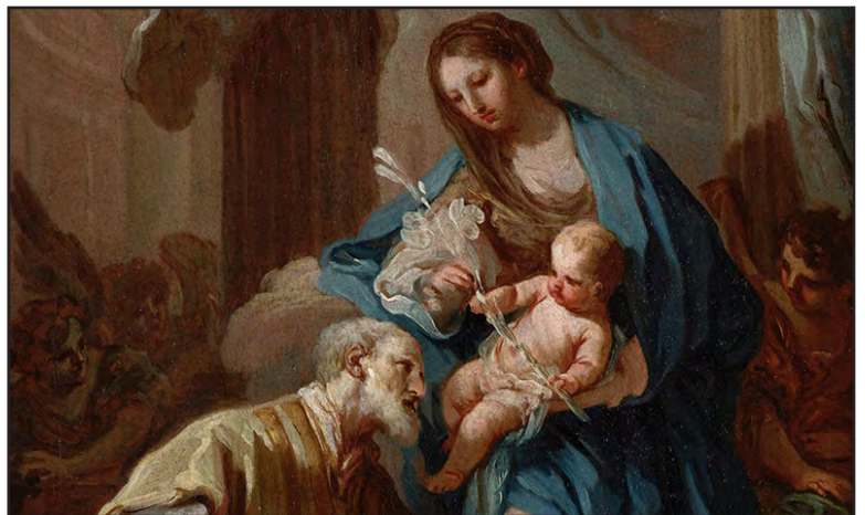
The Madonna Appearing to St. Philip Neri by Sebastiano Conca

St. Philip died on May 26, 1595, and was canonized