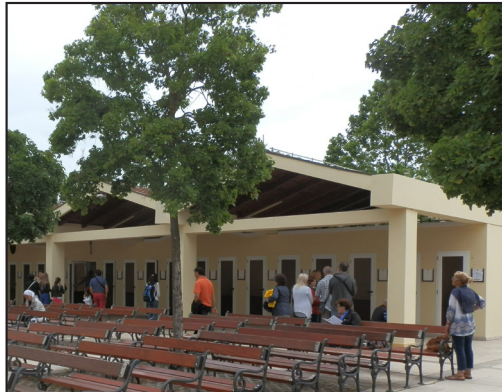
Confessionals in Medjugorje

room, close the door, and pray to your Father in private"). We need this one-on-one time with the Lord. He speaks to us and we speak to Him. He listens to us, and we listen to Him. Prayer is conversation, and never one-way. Can you imagine a telephone call where you could only speak and not hear the person on the other end, or hear that person but they could not hear you? Communication is both ways, and prayer is communication. We clean the house, and we need to clean our "house" – our mind, our bodies, our bad habits – and we do so one step at a time and asking the Lord for His help! Bad habits include, but are not limited to: not praying every day, not fasting (either on bread and water, or from TV programs, cigarettes, excessive drinking, gossip, holding a grudge, being mean), coming late for Holy Mass and/or leaving early, receiving Jesus in the Most Holy Eucharist in the state of sin, or not in a prayerful way, where we really and truly invite Jesus into our hearts and lives and remember we are now Living Tabernacles ourselves after receiving Jesus. Lent is a time of cleansing! After a workout, or a long day, doesn't a clean fresh shower or bath feel terrific? Lent helps