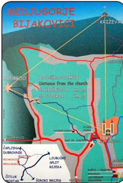
Map in Medjugorje showing Our Lady's triangle

Brothers and sisters, beautiful is the love of the Mother who is leading us in this way. Let us go with a promise to accept Our Lady's call... Let us ask our Mother to pray for us and for all of those dear to us. We need the mercy and strength from heaven. Dear Mother, strengthen our faith, firm up our hope, plant your love in our hearts, so that we can, with clear head and clean hearts, walk to the eternal city. Amen!