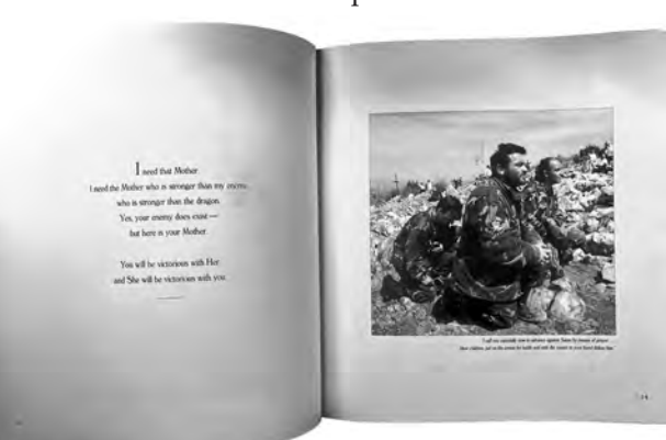
Pages 13 and 14 from the book As She Asks

think myself, being a photographer, I just look back to all the artists throughout the centuries – painters or sculptors or the Sistine Chapel - I'm not saying I'm on that level at all, but to have my camera and to be