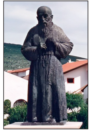
St. Leopold statue in Medjugorje

So, brothers and sisters, do yourself a favor, do your spouse a favor, do your children a favor, do your parents a favor, do your neighbor a favor – make a very, very good Confession. And when you finish, you will not only feel better, you will be better. May Christ be praised.