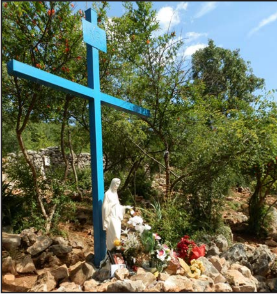
The Blue Cross

There are a lot more resources than people realize there are. I do think there needs to be more helping mothers after the fact because it's not easy. For people that are low income,