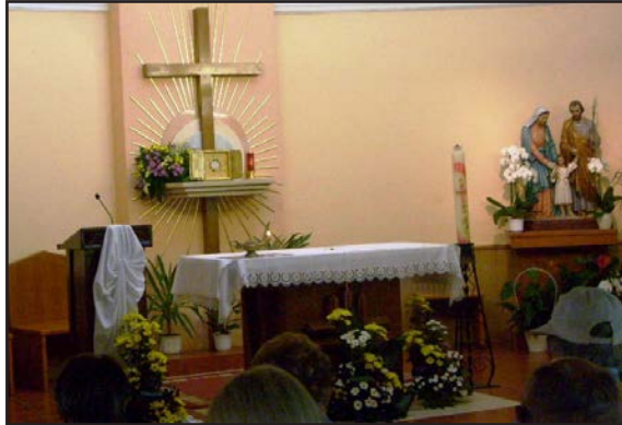
Adoration chapel in Medjugorje

After my doctor examined me, I shared a particularly stressful situation I had that day and how the Lord consoled me when I was checking in for my appointment – the only