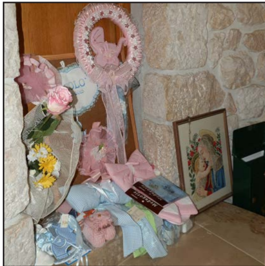
Shrine for Aborted Babies at the Castle in Medjugorje

in virtue of the subsequent conversion of their mother. But, how about those mothers who refused to repent? Would their babies be deprived of Heaven forever? That hardly seems fair!