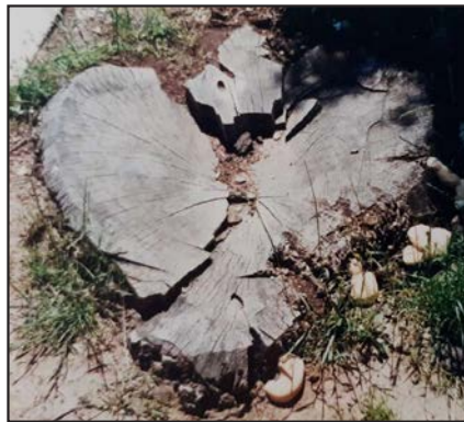
Heart-shaped tree stump in Medjugorje