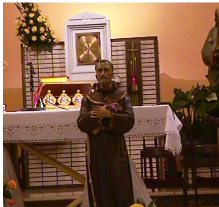
Statue of St. Francis in St. James Church in Medjugorje

"God has chosen St. Francis as His elected one. It would be good to imitate his life" (Our Lady, 10/7/81).