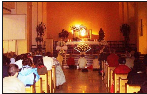
Adoration in St. James Church in Medjugorje

It was late in the evening when they returned to the village of Medjugorje. The rain was very heavy. They noticed the