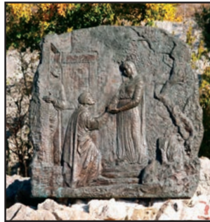
The Visitation Station on Apparition Hill

The centurion said in reply, "Lord, I am not worthy to have you enter under my roof; only say the word and my servant will be healed." When Jesus heard this, he was amazed and said to those following him, "Amen, I say to you, in no one in Israel have I found such faith." (Matthew 8: 8,10)