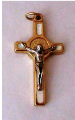
Christmas Day Crucifix