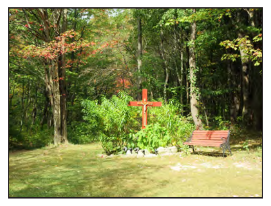
Sitting area on Fr. Ray's grounds

I get ready for a nice hot shower, and then Dublin and I sit in our "prayer-chair" which is also our "eating my breakfast chair"! ☺ It has windows all around it upstairs so I can see all of nature, the beautiful snow on the trees and grass and shrubs,