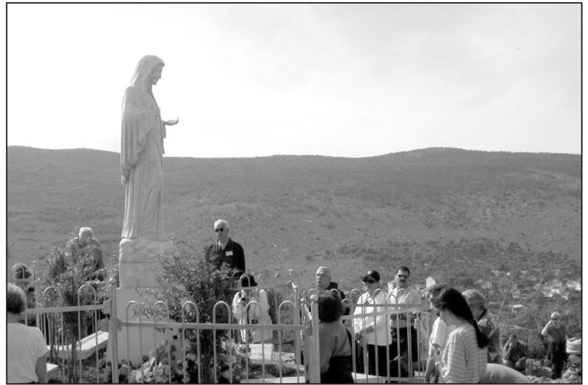
Pilgrims on Apparition Hill where the permanent sign will be

When we reached the place where we were standing before, we saw flashes of light on the hillside, three times, and something was pulling us forward to come closer. So six of us were pulled so quickly other people could not keep up with us. When we came close to Our Lady, we saw the beauty that no words can describe. My eyes never saw anything more beautiful than that. Our Lady has a gray gown, white veil, a crown around Her head with stars. She has blue eyes and dark hair, and She's standing on a cloud. At that very moment, we all knelt in front of Our Lady.