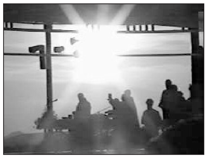
This photo captures the "miracle of the sun," during Mass in Medjugorje. The shape of the sun is called "the door to Heaven."

"As for hell, there is one huge fire in the middle. First, we were shown people in normal condition before they were caught by that fire. Then as they are being caught by that fire, they become the shape of animals, like they have never been humans before. As they are falling deeper into the fire, they yell against God even more. Our Lady says that, for all those who are in hell it was their choice,