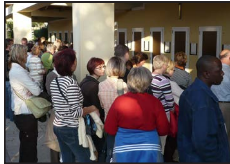
Confessionals in Medjugorje

I'm eager to get to confession and to make a really great, deep confession. I think that's one of the fruits of Medjugorje, one of the five big pillars, five little rocks that we need to lean