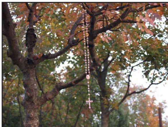
Photo taken on Cross Mountain

"...help the needy, and in their want, do not send them away empty-handed" (Sirach 29:9).