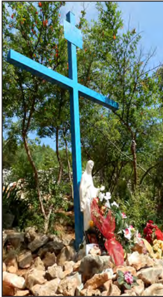
The Blue Cross