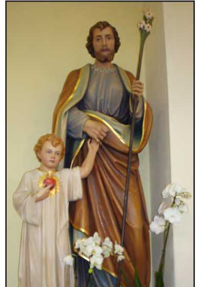
St. Joseph statue in Medjugorje

Editor's note: You can visit www.consecrationtostjoseph.org for more information on the Consecration to St. Joseph.