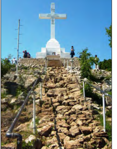
Cross on Mt. Krizevac

"The first night of the Jewish Passover and Holy Thursday do not always fall on the same day, but on this year it did.