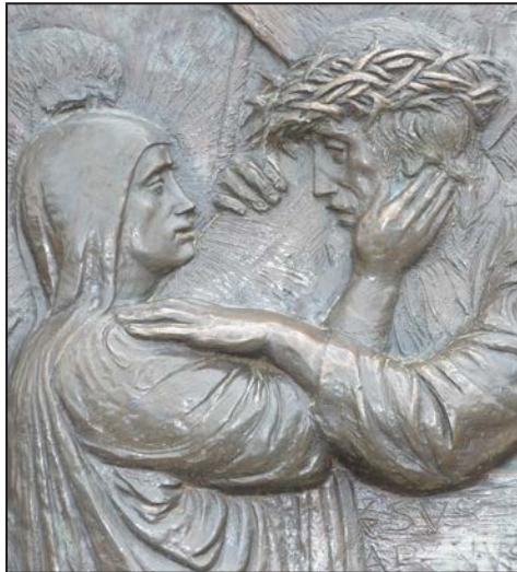
The Fourth Station of the Cross on Cross Mountain

As we reflect on the suffering of Jesus, we come to realize the degree of love our Father and Jesus had for us. Many have watched the movie, The Passion of the Christ , and were given a beautiful but horrifying account of Christ's suffering and death. There were times during the movie I could not keep my eyes open to watch the brutal beatings! This movie brought out the reality of what we have read in the accounts of the passion of Jesus. Our sufferings are minimal in comparison.