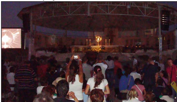
Adoration in Medjugorje

"That's what Medjugorje is about. Whatever the Vatican says about the apparitions, I'll believe. You know it is what the Holy Spirit wishes for. I don't even think about