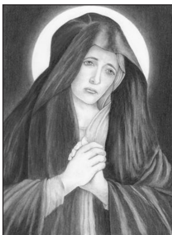
Our Lady of Sorrows card

The beginning of February was particularly difficult for me personally. The 28 year-old son of friends died unexpectedly. Although I knew better, I still questioned why God allowed this to happen. The parents of the young man are such good and holy people. Why do they have to endure this suffering? I struggled all day with this, and the next morning, I heard a gentle whisper in my heart from Our Lady. “Read the message of January 2 again.” And so I did. The following words jumped off the page: “ My children, do not waste time posing questions to which you never receive an answer. At the end of your journey on earth, the Heavenly Father will give them to you. Always know that God knows everything; God sees, God loves. ” I printed these words and placed the paper in my purse so I could re-read them whenever I began to wrestle with this. Providentially at Mass that same day, I saw the parents of the young man. I have never seen them at that Mass before. They belong to a different parish. As I offered condolences after Mass, I felt prompted to share Our Lady’s