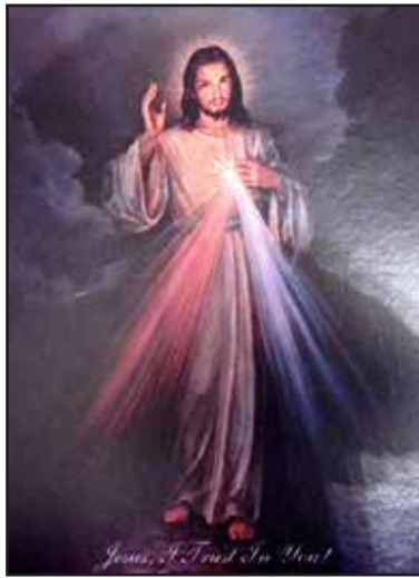
Divine Mercy image at the Carmelite monastery

When we got to my father’s house, I stayed for a while with him. He was worried about this news ruining the family’s Christmas. When I left, I drove around looking for a good spot to park and call my sons. I soon found myself at the Carmelite monastery. After I called my sons, I decided to go in and pray. As I walked in the door, it was dark, but I could see a painting on an easel up by the altar. I assumed it was a painting of the Nativity, since Christmas was two days away. But no, it was the Divine Mercy image,