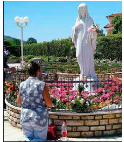
Praying at the statue in front of St. James Church in Medjugorje

Jesus showed us His love for us and gave us great hope in His resurrection. Can we pray for anything more important? Our other prayer intentions are important, but our relationship with Father, Son and Holy Spirit is the most important.