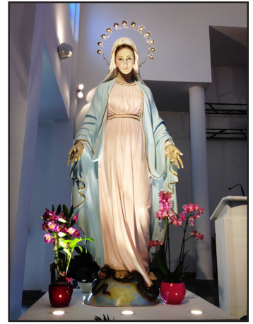
Statue in Tihaljina

www.childrenofmedjugorje.com , Children of Medjugorje, February 2019 report