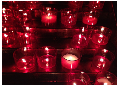
Candles from the candle area next to St. James in Medjugorje

To illuminate is to bring light where there is darkness, and we all know the world is filled with much darkness right now, and our Mother is calling us to be Her little lights. Even one candle will illuminate a dark place. Wouldn't it be wonderful to bring light into the darkness of a soul of another, and allow them to do the same for us?