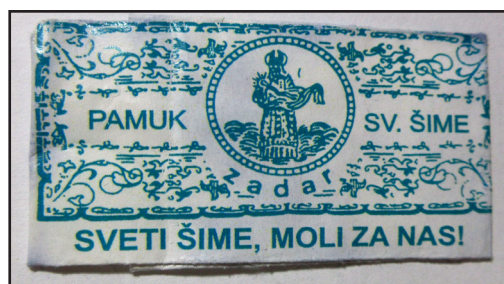
St. Simeon relic

Now back to the trip to Zadar – while we were there, we were supposed to go to the church where St. Simeon's relic is kept. (It's actually his whole incorrupt body.) When we arrived, Cindy had to tell us again that we just got some bad news. They were going to be doing a dress rehearsal