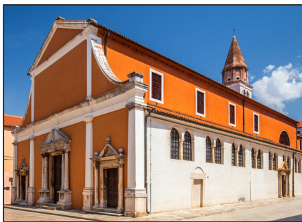
St. Simeon Church in Zadar

"Do not leave the church without an appropriate act of thanksgiving." (Our Lady, October 1984)