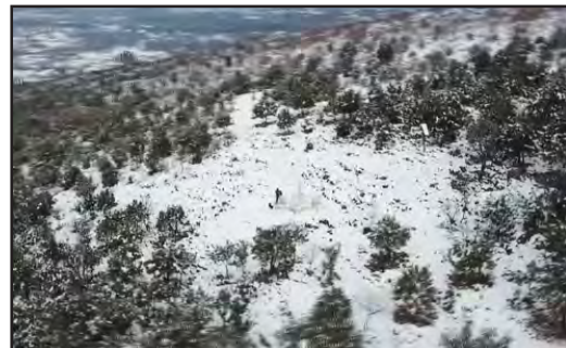
Snow in Medjugorje, January 2019

simple person, full of common sense who has a deep faith in God's love. That Tuesday morning, on December 5th, the cold with its freezing temperatures fell upon the village. Odette climbed up the hill of Podbrdo and walked away from the normal path in order to explore the blessed place a little more.