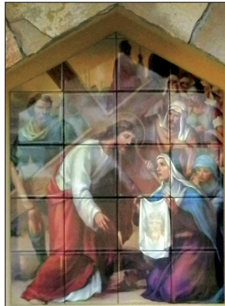
6 th Station, near the Risen Jesus statue in Medjugorje

So you will meet me, and you will recognize the Father because you cannot reward Him for what He gives you. He is like a spring exuding water generously. If you are like that, you are my Father's child. Also accept the cross that you cannot repay God for all His love. Be like a child that enjoys his father's and his mother's love.