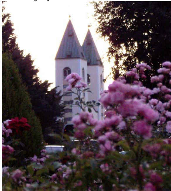
Steeple of St. James

my first "spiritual kiss" and call of Our Lady of Medjugorje began. You see, the lady introduced herself and told me she was a technician at Roswell, the cancer hospital where my mother was having her surgery as we spoke, and she told me not to worry, that my mother would be fine. And she was! What she could not possibly know is that before I