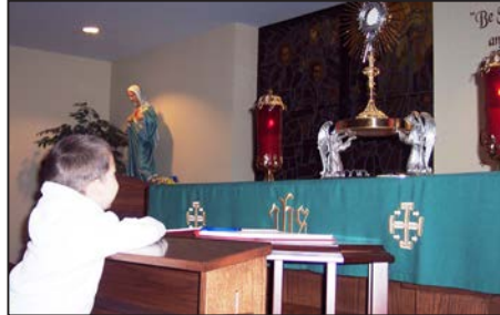
Bread of Life Adoration Chapel in Erie, PA

And particularly the priests! Our ministry in Indonesia has been so effective because we start with the priests, and God touches them in extraordinary ways during that retreat. That is why it is so difficult in Australia. I have been three years now assigned in Sydney. I have been working hard, with the full support of Cardinal Pell, the Archbishop who has been recently removed from there. But we haven't gotten a priest there yet who is willing to offer a church for Perpetual Adoration. We don't have it in that huge city of Sydney. Yet in Indonesia we have been able to establish 45. God is showing us that it is not us, it is His power. It is His power and His timing. But I hope the priests here will take