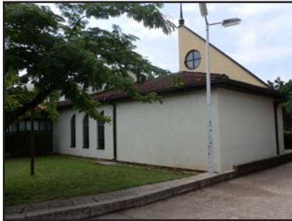
Adoration Chapel in St. James in Medjugorje

Listen to a few words of Pope John Paul II. And very importantly, this is for priests. (I thought we were going to have about 20, but we only have a few, so I will really have to hammer the message home to these few!) He said, (this is his Encyclical, Ecclesia de Eucharistia ) – "It is the responsibility of pastors to encourage the practice of Eucharistic Adoration and also to encourage exposition of the Blessed Sacrament in particular!" And then he gives a little personal testimony.