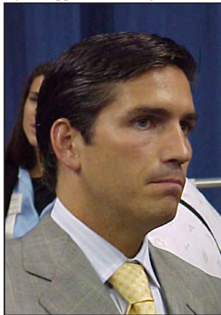
Jim Caviezel at the Notre Dame Medjugorje Conference in 2002

Editor's note: I have been saving this article for over a year, and have not felt prompted to use it until now. But this was Our Lady's timing as Jim is now part of a new movie called, Paul, Apostle of Christ , which premieres on March 23.