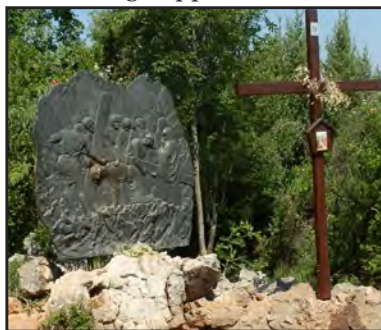
Third Station on Mt. Krizevac

The Medjugorje Message, UK, February 2008 issue