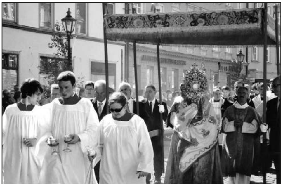
Corpus Christi procession in Augsburg, Germany

Forty Hours Devotion: This is the adoration and praise of Jesus Christ in the Blessed Sacrament over 40 semi-continuous hours. The number "40" is derived from the number of hours Christ lay in the tomb.