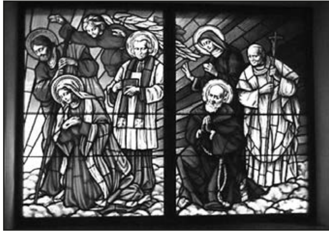
Two of the stained glass window panels in the Bread of Life Chapel in Erie, PA

There are so many fruits of visiting the chapel often - the best is that you develop a very personal relationship with Jesus. Archbishop Fulton Sheen never missed a day of