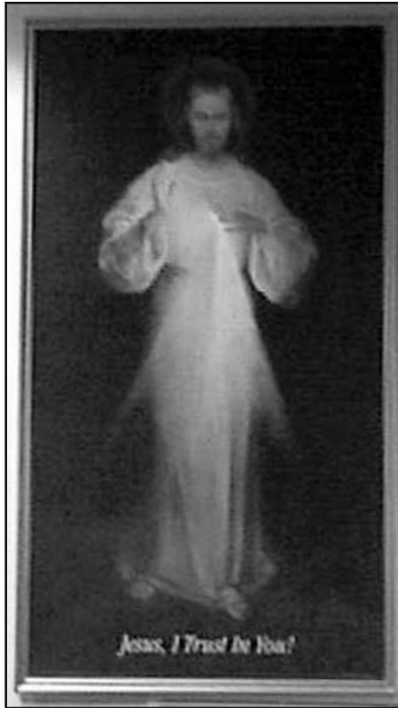
Divine Mercy painting in the Bread of Life Chapel

You have probably guessed by now that my little story is an allegory. At the age of 15 I left the Catholic Church, my home. Soon afterwards, I became a dedicated Protestant. The letters from my Father that I read and reread were the Sacred