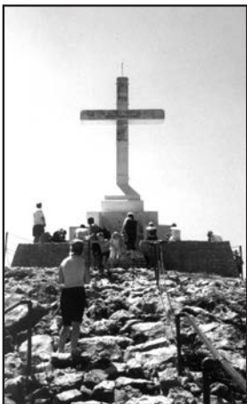
Pilgrims on Cross Mountain