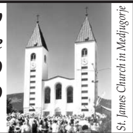
St. James Church in Medjugorje

In June of 1986, Pope John Paul II said, in response to a group of twelve Italian bishops seeking pastoral advice on people making pilgrimages to Medjugorje, "LET THE PEOPLE GO TO MEDJUGORJE IF THEY CONVERT, PRAY, CONFESS, DO PENANCE AND FAST."