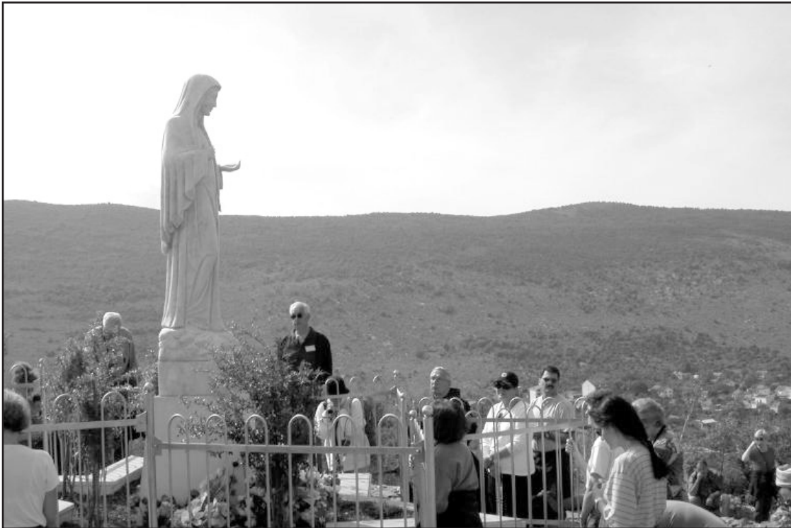
Pilgrims on Apparition Hill where the permanent sign will be

In the meantime, some other people who started to walk with us reached the base of the hillside and they saw something unusual happening to us, and they suggested that the next day when we come, we should bring holy water and sprinkle the apparition. So when Our Lady appeared on the