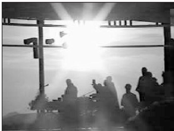
This photo captures the "miracle of the sun," during Mass in Medjugorje. The shape of the sun is called "the door to Heaven."

"As for hell, there is one huge fire in the middle. First, we were shown people in normal condition before they were caught by that fire. Then as they are being caught by that fire, they become the shape of animals, like they have never been humans before. As they are falling deeper into the fire, they yell against God even more. Our Lady says that, for all those who are in hell it was their choice,